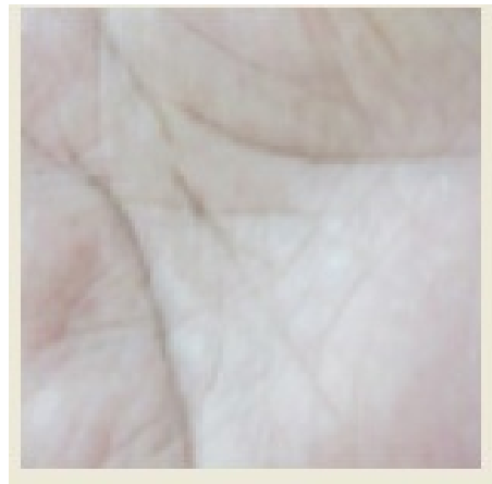
Figure 3: Extracted palmprint image

Region-of-interest (ROI) is determined for cropping of palmprint image from the hand image. Square ROI mask is used in our work. A variable size of mask is created to crop the Region-of-Interest (ROI). By referring to the distance between the two key points, the location of the palmprint area is estimated. The width of the fingers is approximately 0.5 times of D . The length for each side of the square is calculated using equation, length, L = 1.4 \times D . Thus the cropped palmprint is extracted. The extracted palmprint image is shown in Figure 3.