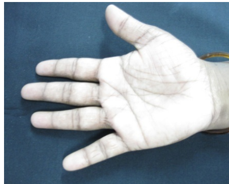
Figure 2: Acquired hand image

this work. The hand image is usually taken in front of a dark intensity background to ease the image segmentation process. The fingers are required to spread apart and the hand is lean against the background. Images are stored in JPEG format. The acquired hand image is shown in Figure 2.