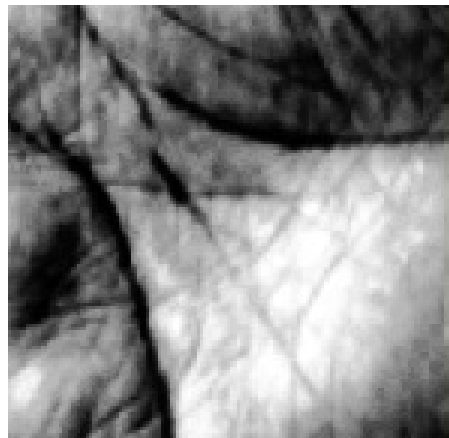
Figure 4: Feature Extraction using histogram equalized method

Since the palm lines, such as principal lines, wrinkles and ridges can only be acquired in different resolution, multi resolution analysis using Wavelet Transform is proposed. Multi resolution wavelet transform can extract different types of line in different resolution level. First level decomposition allows the extraction of ridges information. When the decomposition level increases, larger palm lines such as wrinkles and principal lines are extracted. Here we are using lifting Haar wavelet transform for feature extraction. Figure 4 and 5 gives the feature extracted image using histogram equalized image and gray scale image respectively. Compared to discrete Haar wavelet transform the lifting method provides bet-